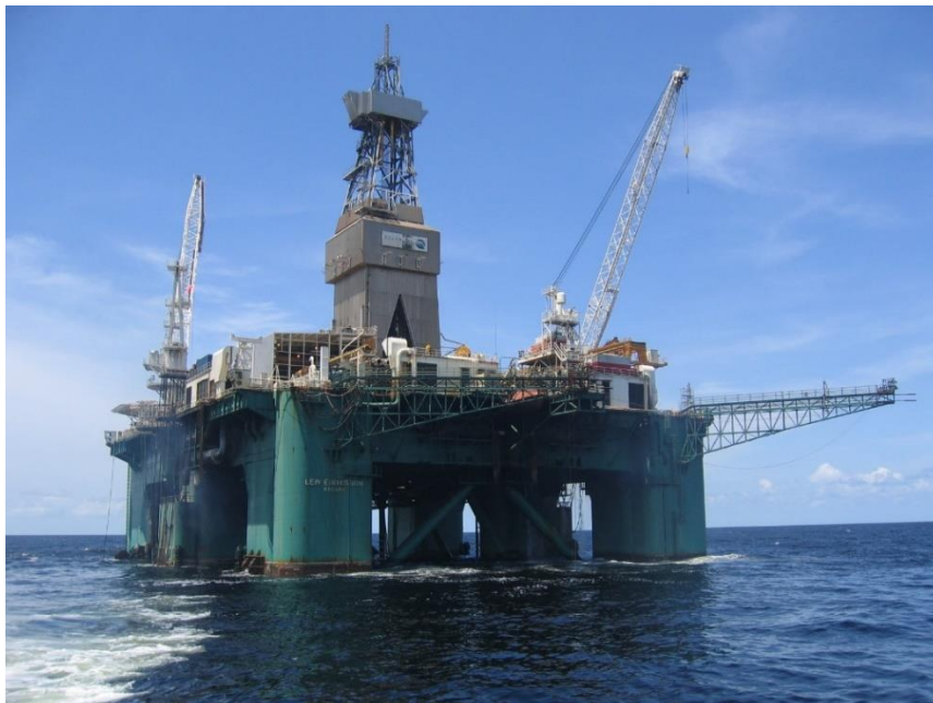
The semi-submersible Leiv Eiriksson will be used to spud the well in the Zumba prospect

The well, designated as 6507/11-11, will be drilled using Ocean Rig's semi-submersible Leiv Eiriksson in water depth of 272 metres in the Halten area of the Norwegian Sea, about 14 kilometres south-east of the Heidrun platform. Tullow Oil is targeting hydrocarbon potential in sandstones of the Upper Jurassic Rogn formation and the well will be drilled to a total vertical depth of 3,000 metres. The drilling is estimated to take 50 days, and may be extended by another 8 days in the event of a discovery that requires extended sampling and logging.